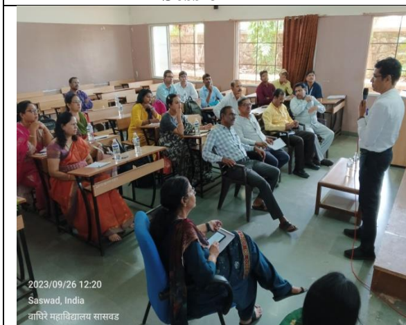
Discussion on Syllabus Session -III