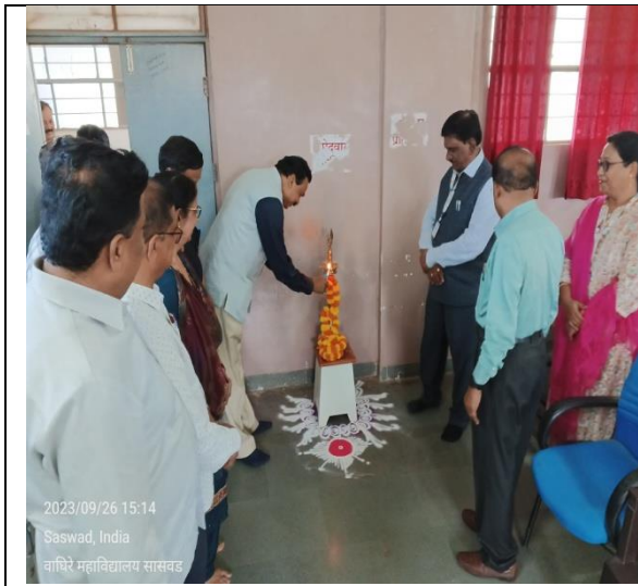
One Day Workshop Inauguration