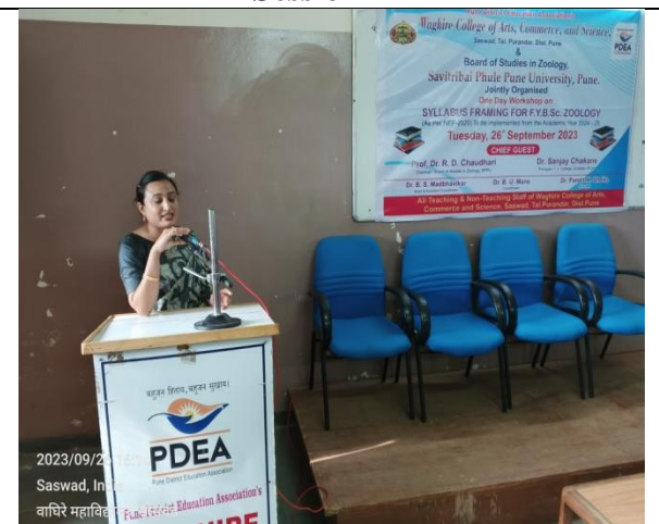
Participant teacher's Feedback on Workshop