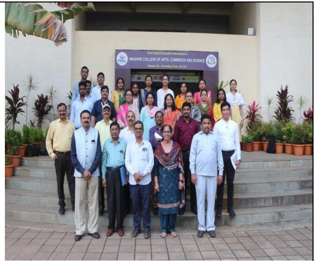
Group photo of Participants and Organizers