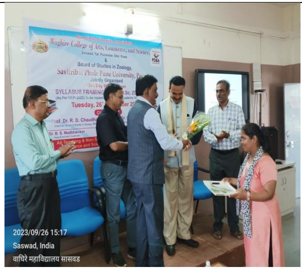
Felicitation of the invited Guest