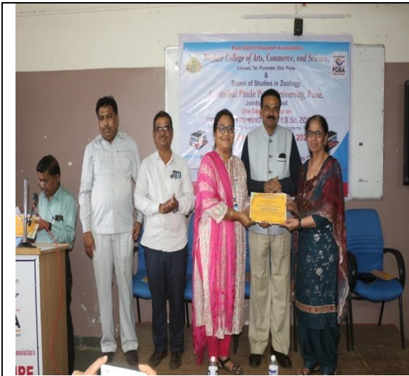
Valedictory function - Distribution of certificates